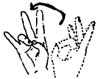
Seventh or $ 7.00