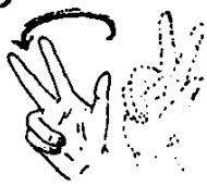
Third or $ 3.00