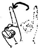
First or $ 1.00